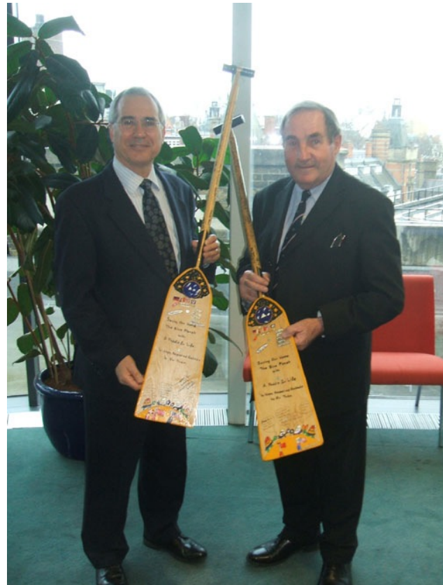
Lord Stern with Paddle for Life

“Greening the Vale” What is happening in the Vale of Evesham.